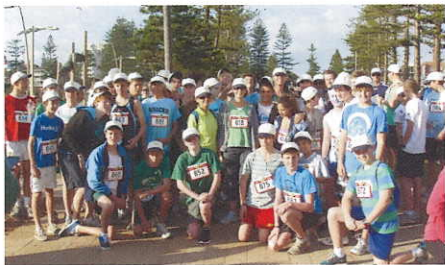
The St Augustine's Team before the big event

However, it is even more devastating when the person involved is a teenager and just beginning their journey of life's many and varied experiences.